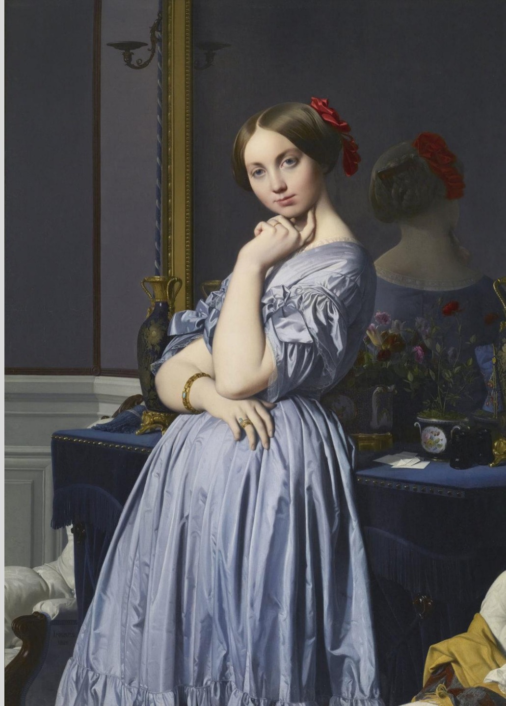
Ingres, Comtesse d'Haussonville , 1845