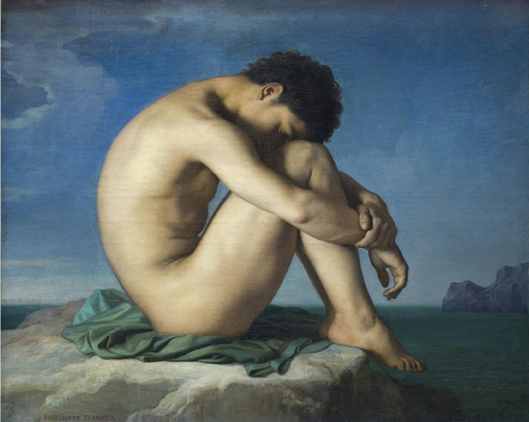
Hippolyte Flandrin, Young Man Seated by the Sea, 1836