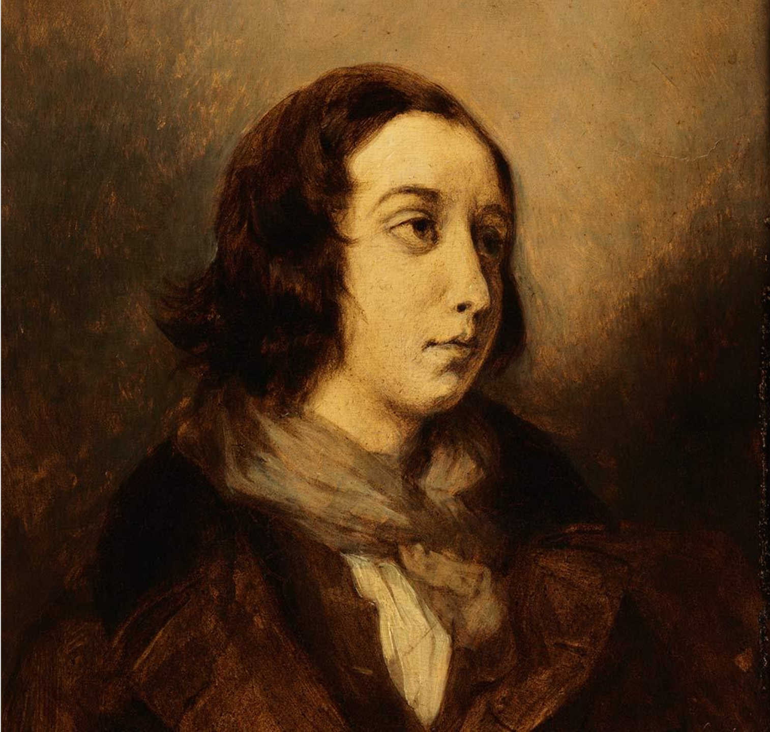
Delacroix, Portrait of George Sand , Date unknown