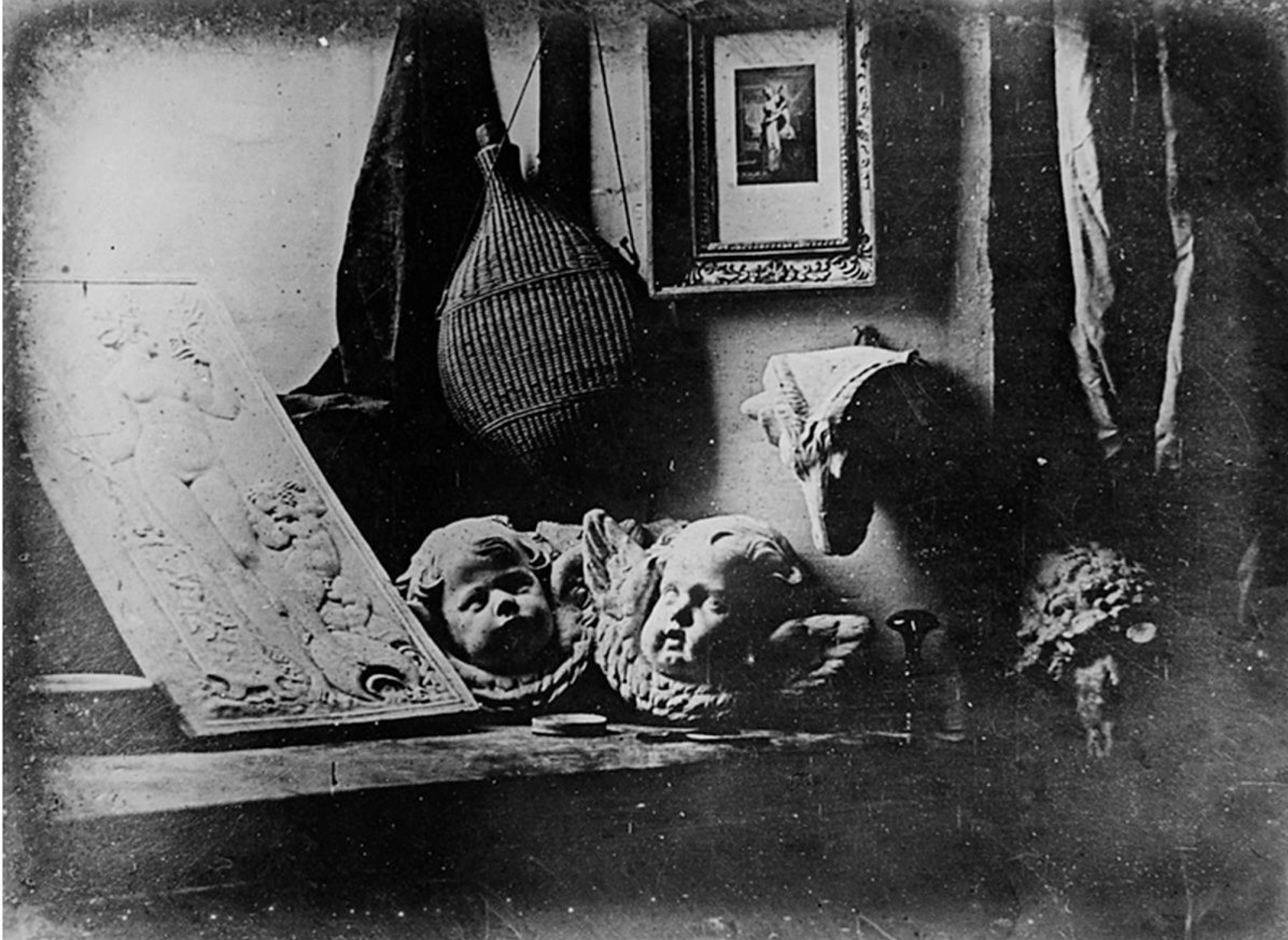
Daguerre, The Artist's Studio , 1837, daguerrotype