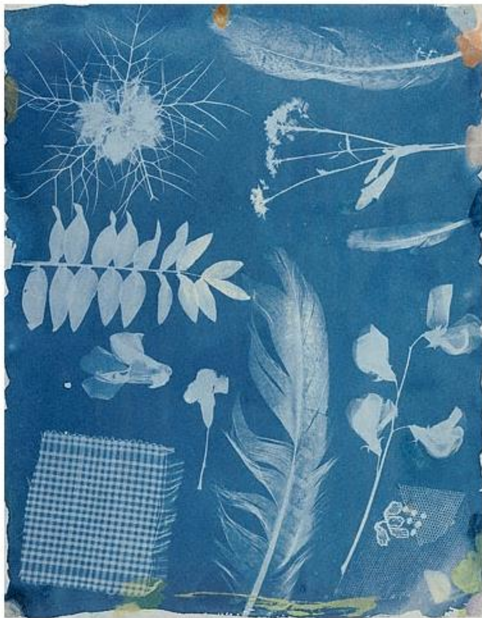
Bayard, Arrangement of Plant Specimens , 1842