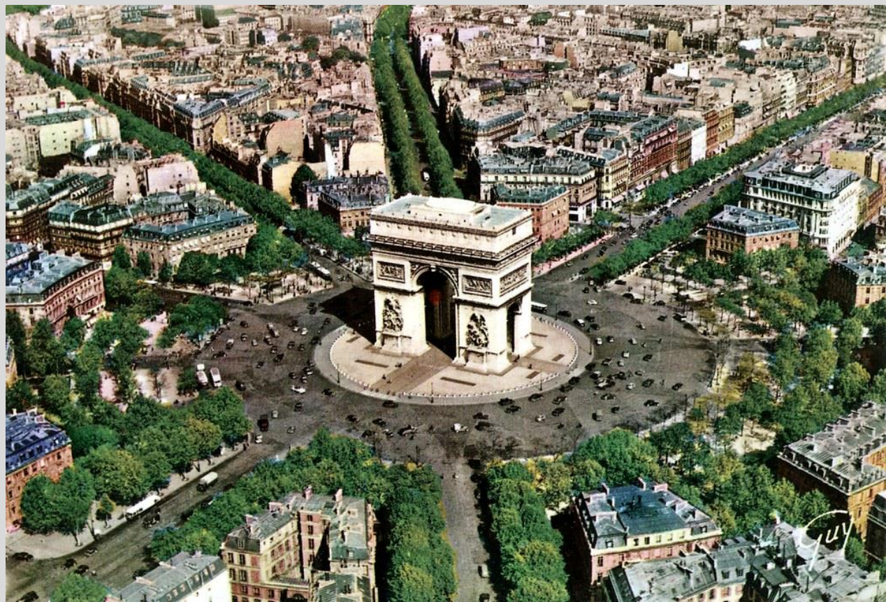
Arc de Triomphe Begun 1806, finished 1833-36