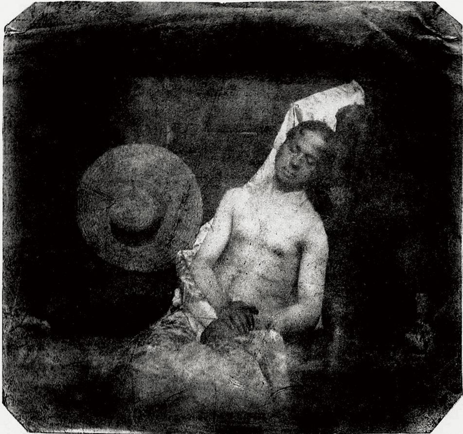
Bayard, Self-Portrait as a Drowned Man , 1840, Direct positive print