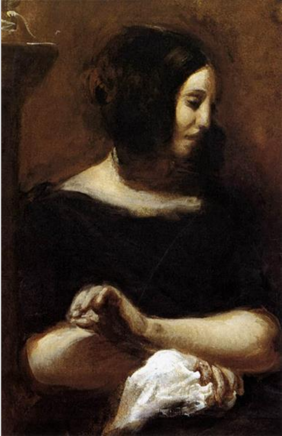
Delacroix, Study of George Sand , 1838