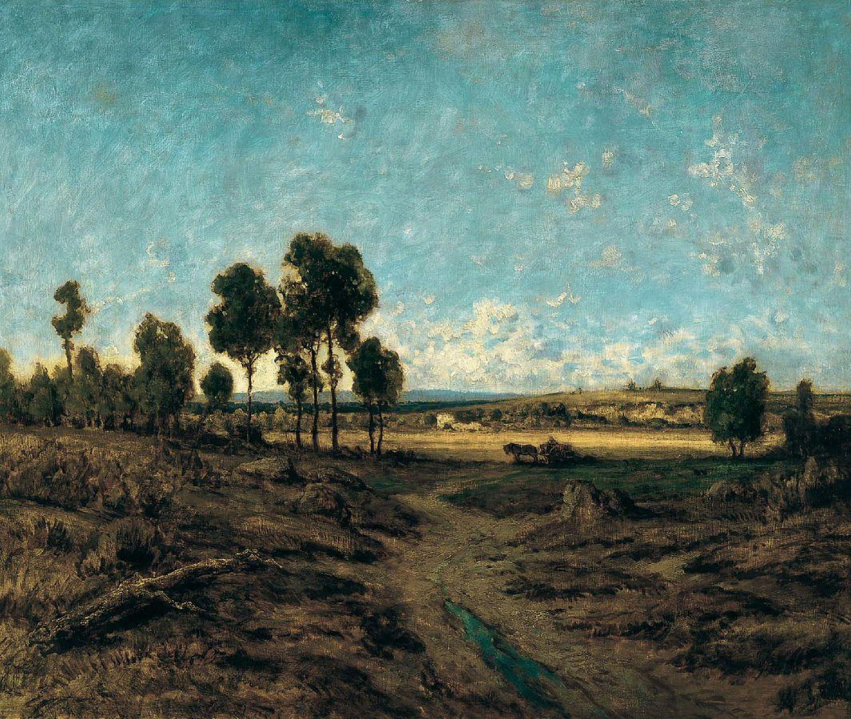
Rousseau, View of the Plain of Montmartre, 1848