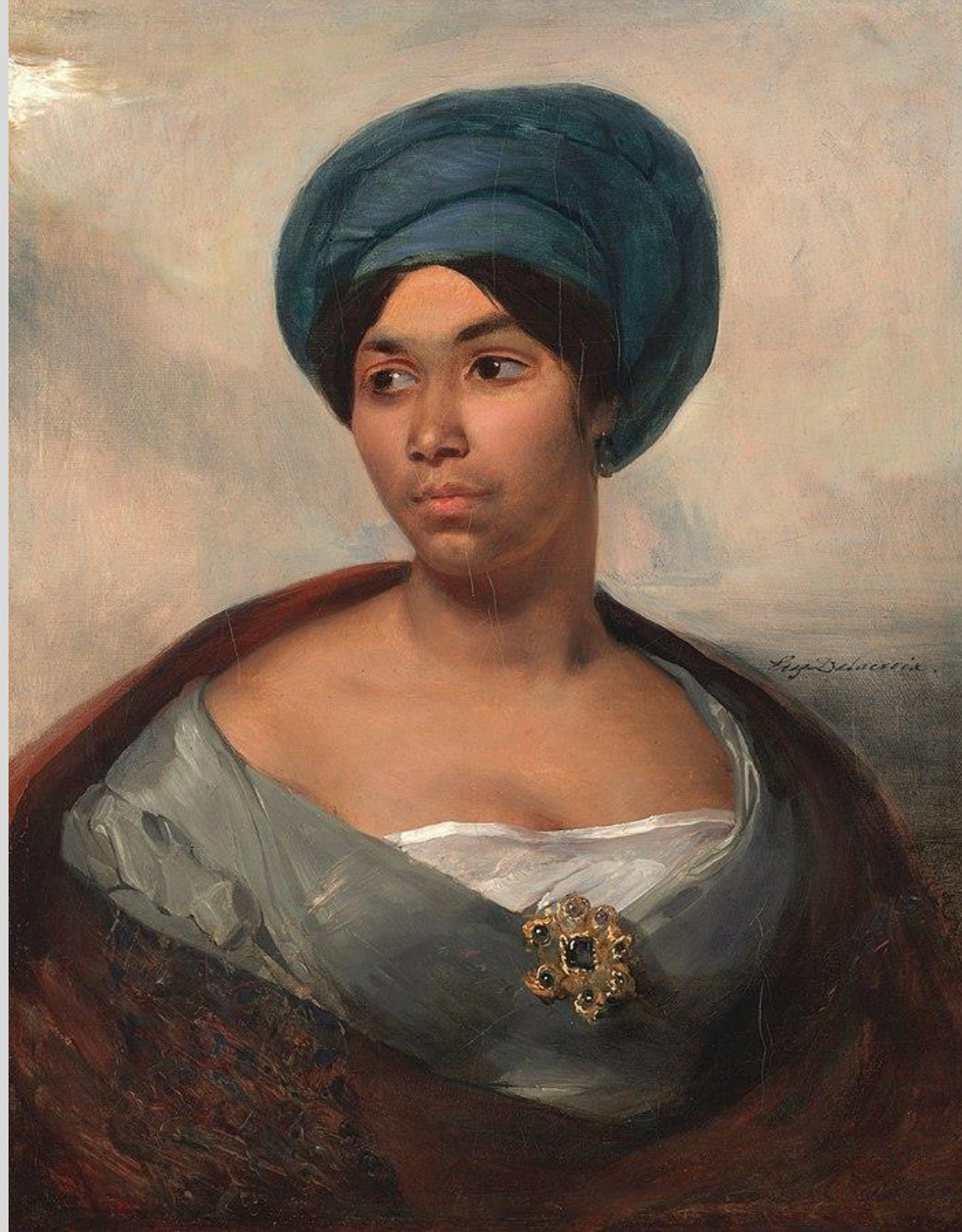
Delacroix, Portrait of a Woman in a Blue Turban, 1827