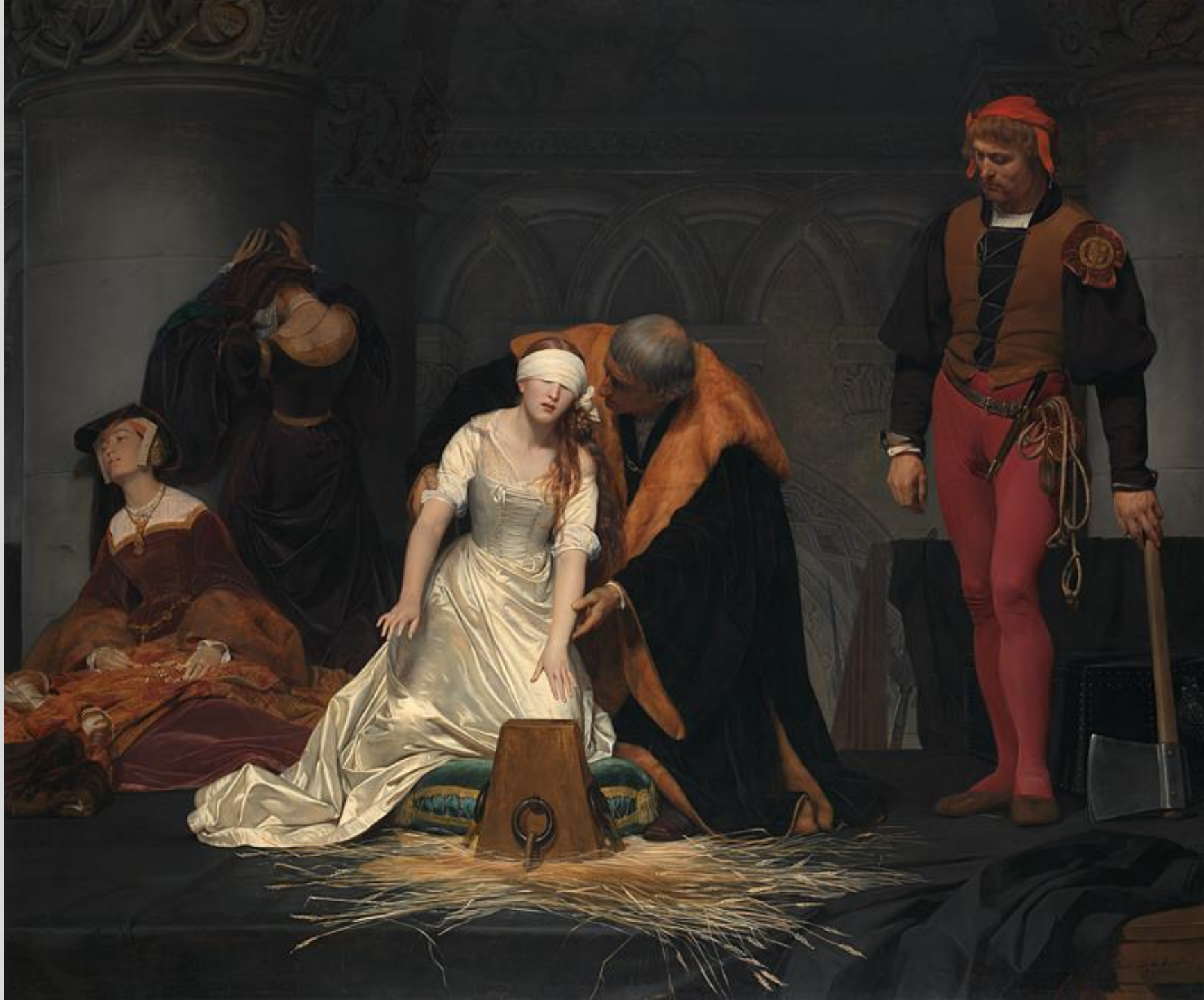
Paul Delaroche, The Execution of Lady Grey , 1833