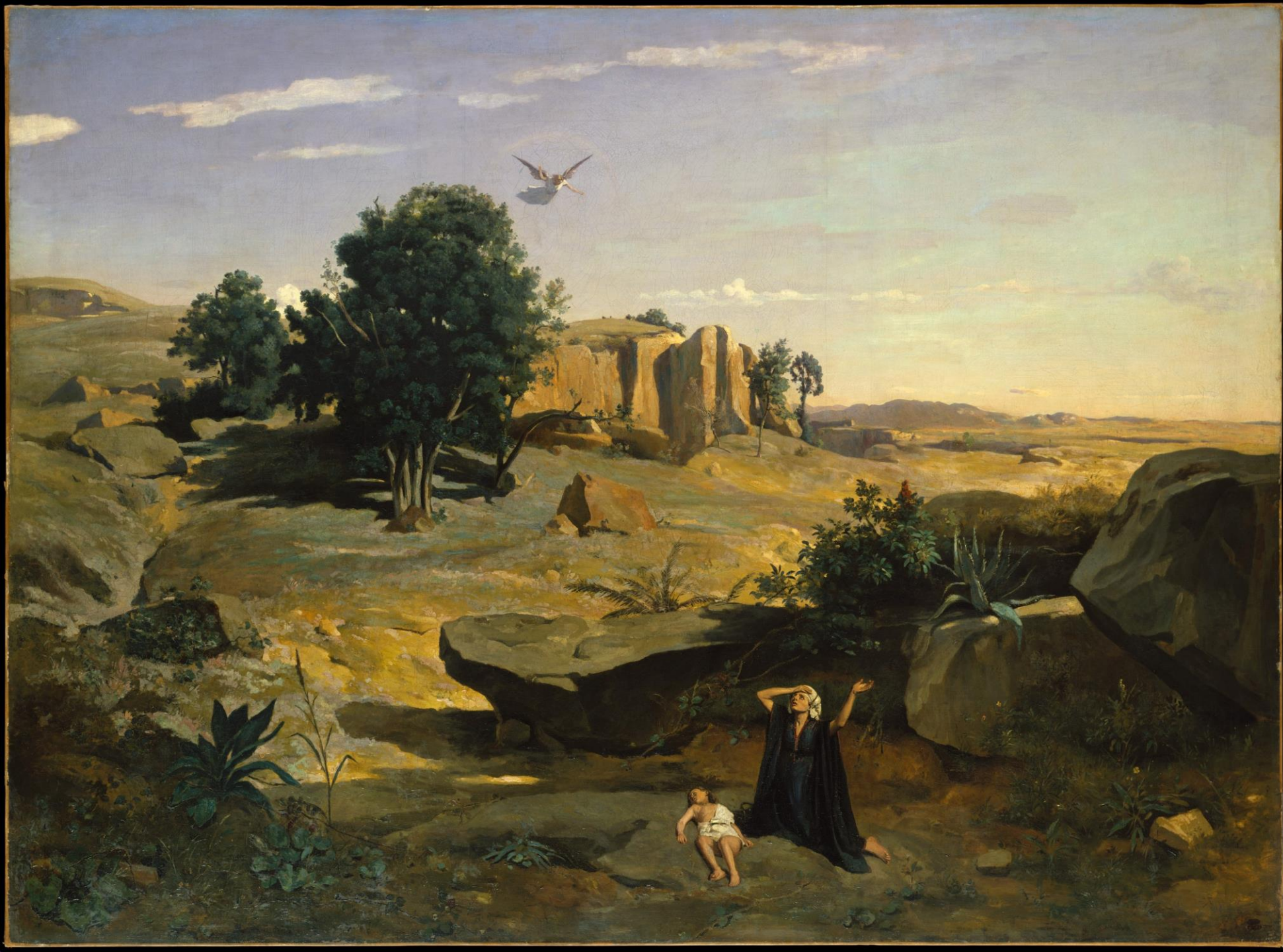
Corot, Hagar in the Wilderness 1835