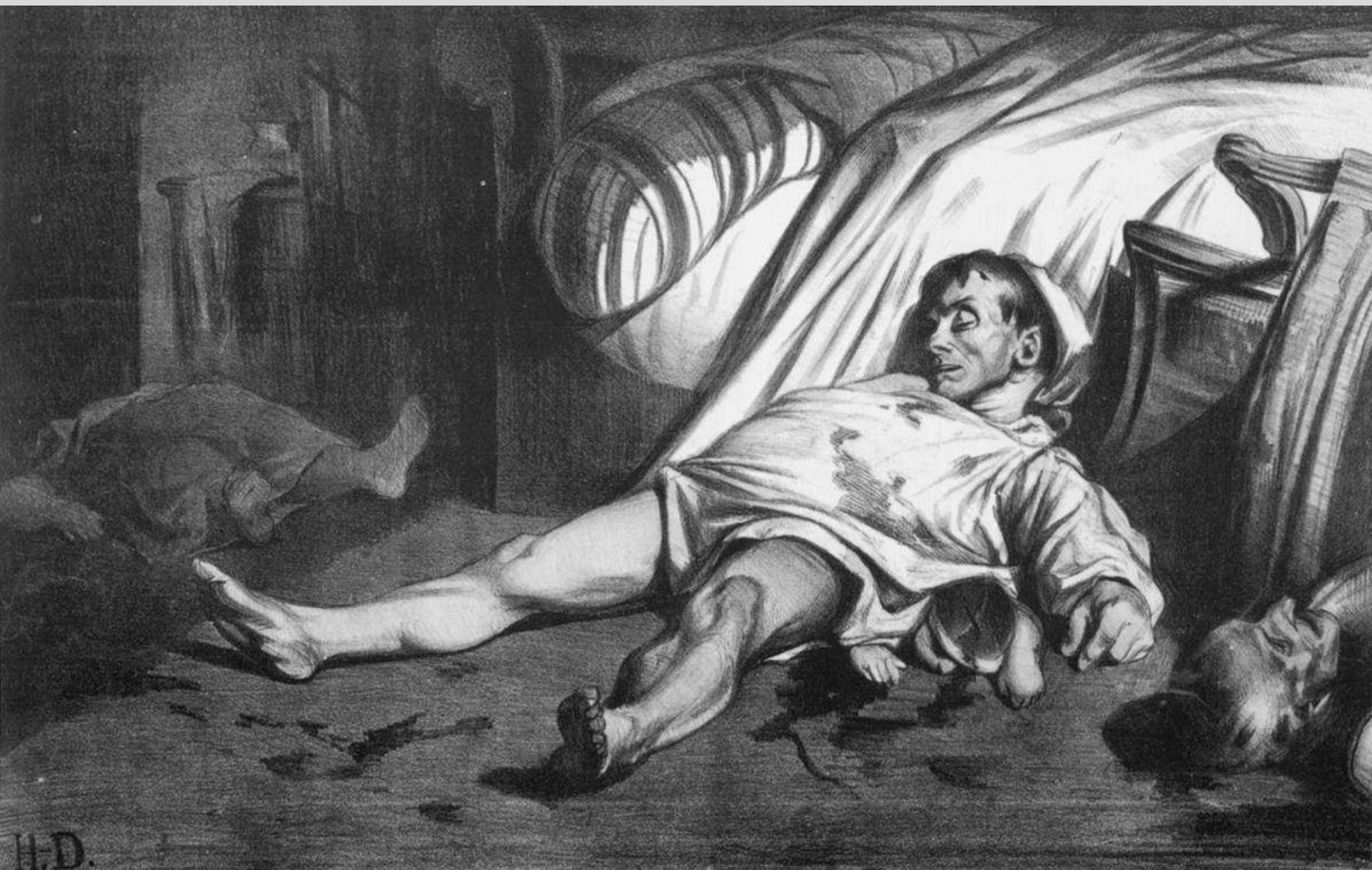
Daumier, Rue Transnonian , April 15, 1834, 1834, lithograph