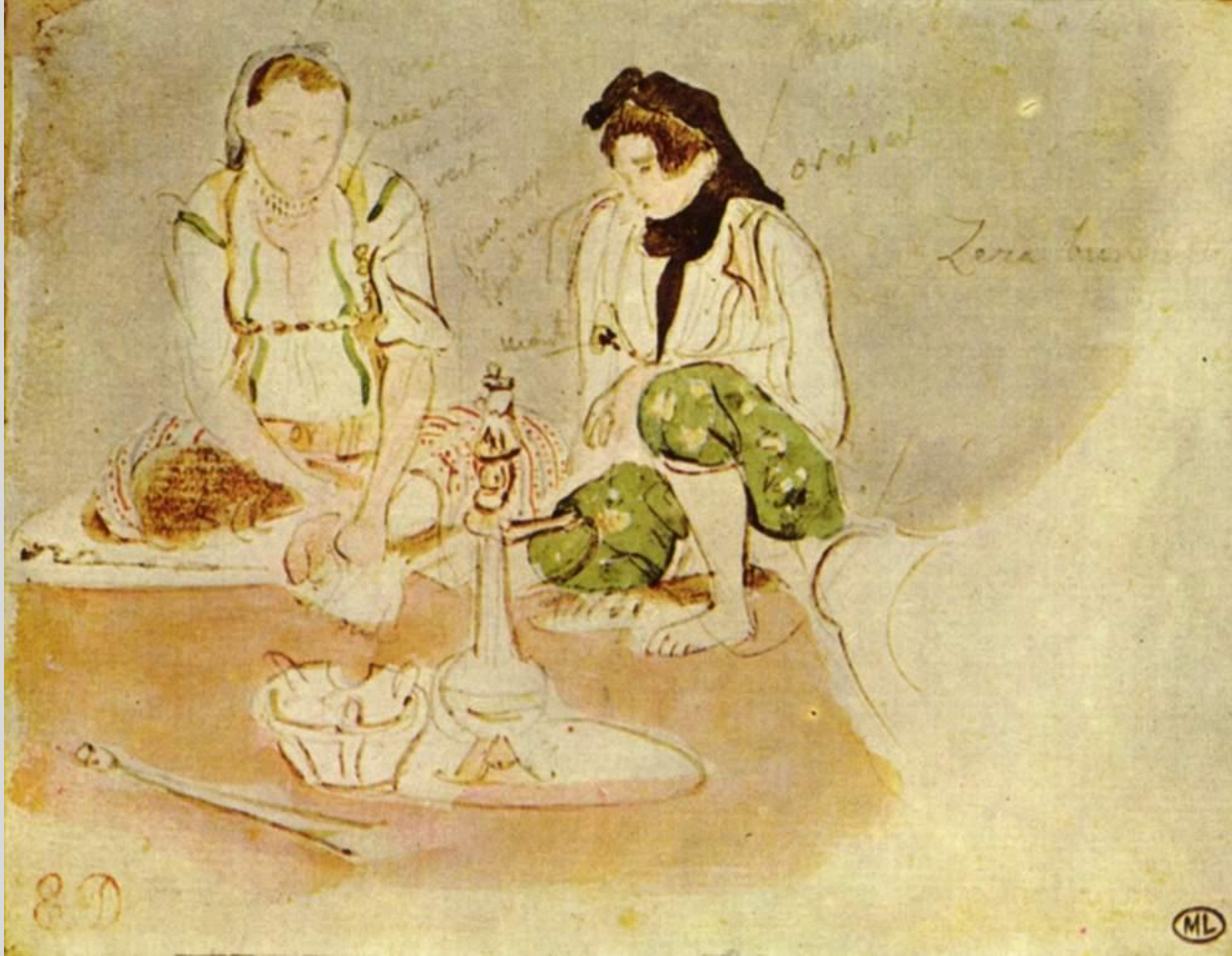
Delacroix, Studies for The Women of Algiers, 1832, Ink and watercolor