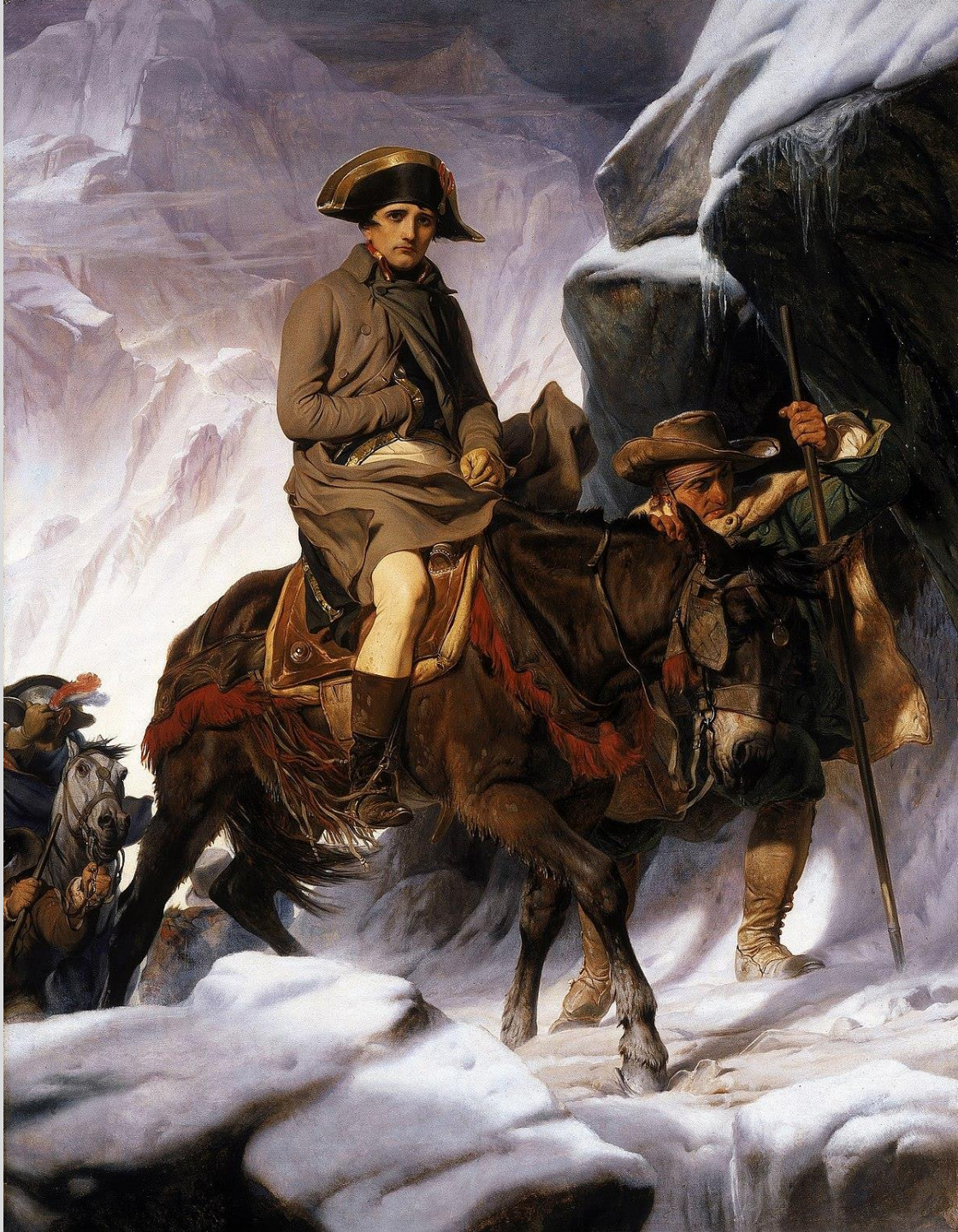
Paul Delaroche, Napoléon Crossing the Alps, 1850