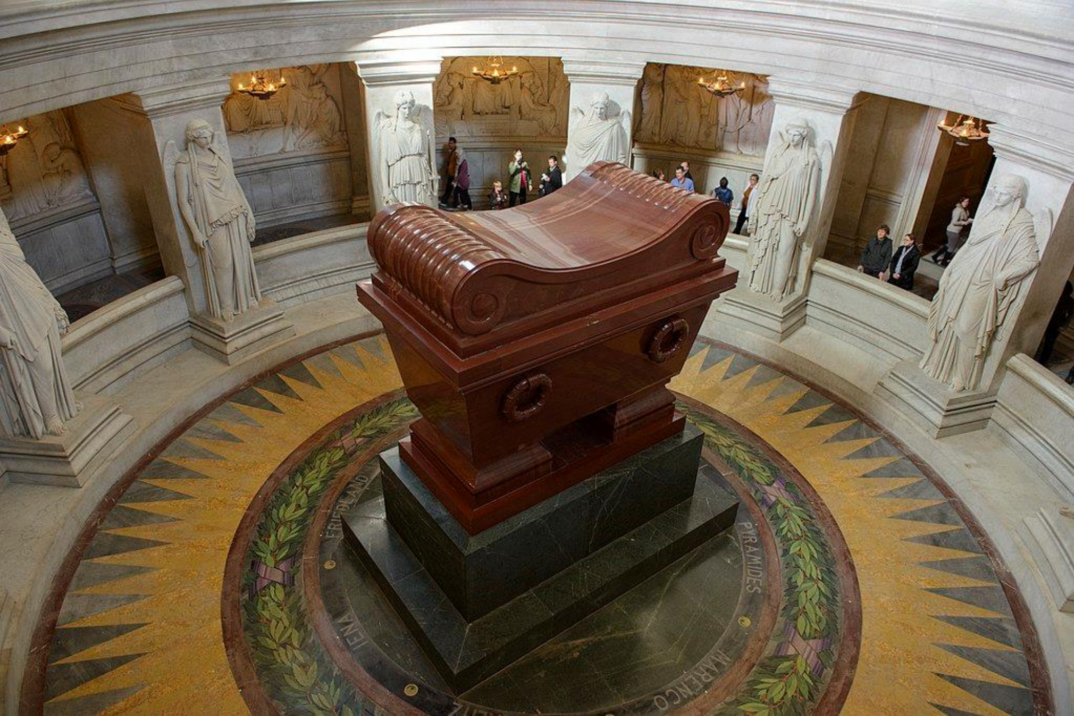
Visconti, The Tomb of Napoléon, 1840-60