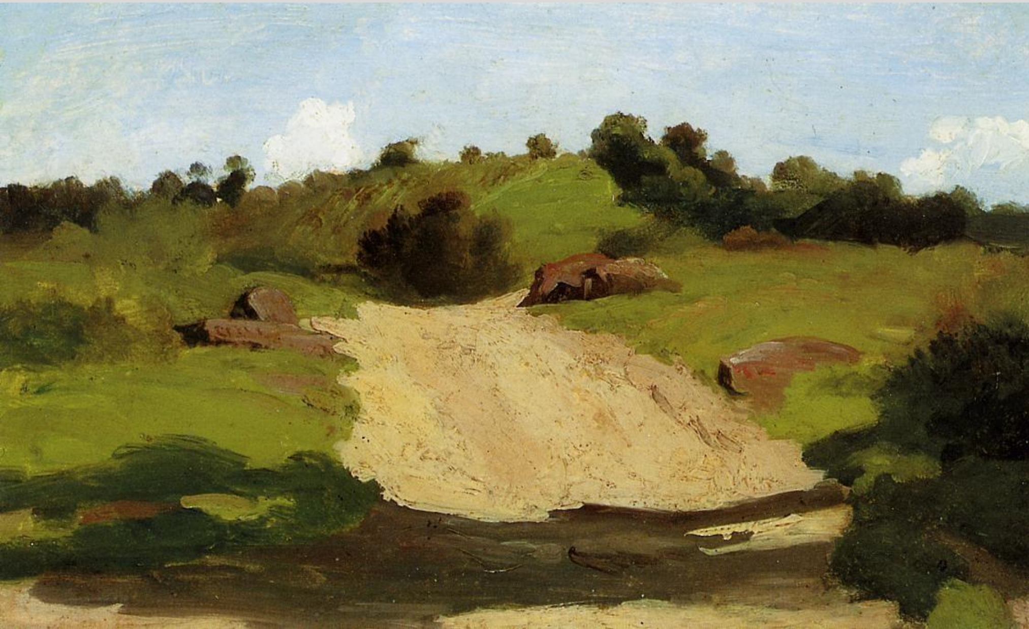
Corot, A Rising Path , 1845