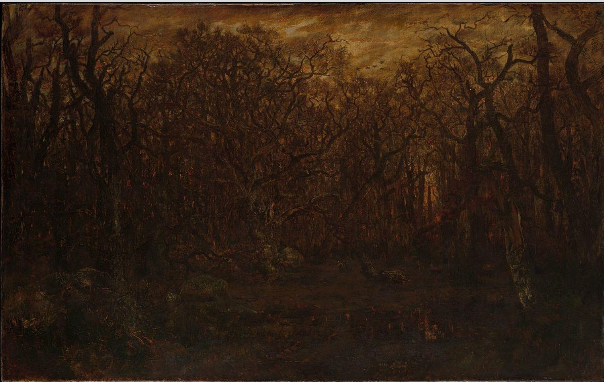
Rousseau, The Forest in Winter at Sunset, 1845-6