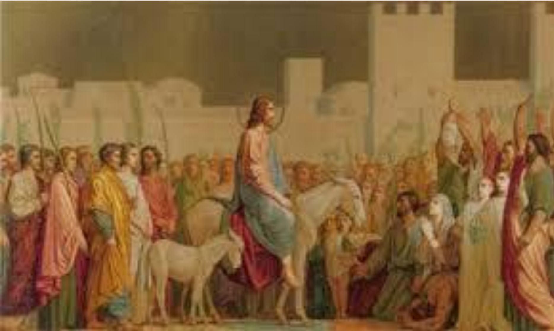
Hippolyte Flandrin, Christ's Entry into Jerusalem 1842-44