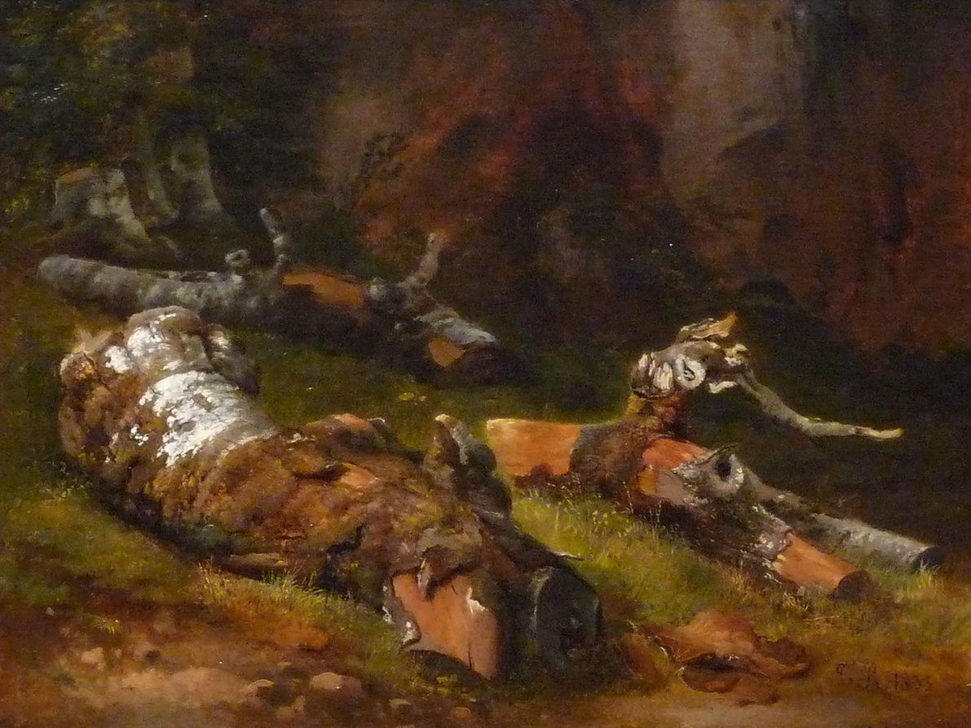
Rousseau, Study of Tree Trunks , 1833