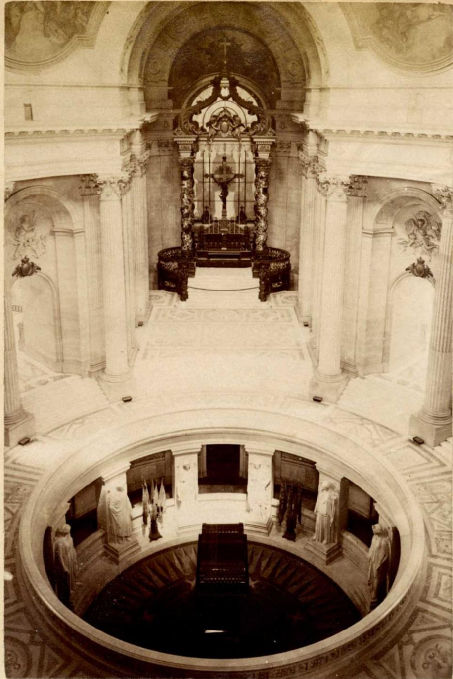
Anon, Photo of The Tomb of Napoléon in Les Invalides , 19 th c.