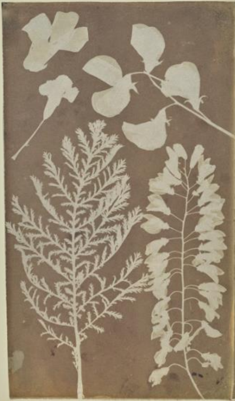
Bayard, Untitled (Plant Specimens) , 1839