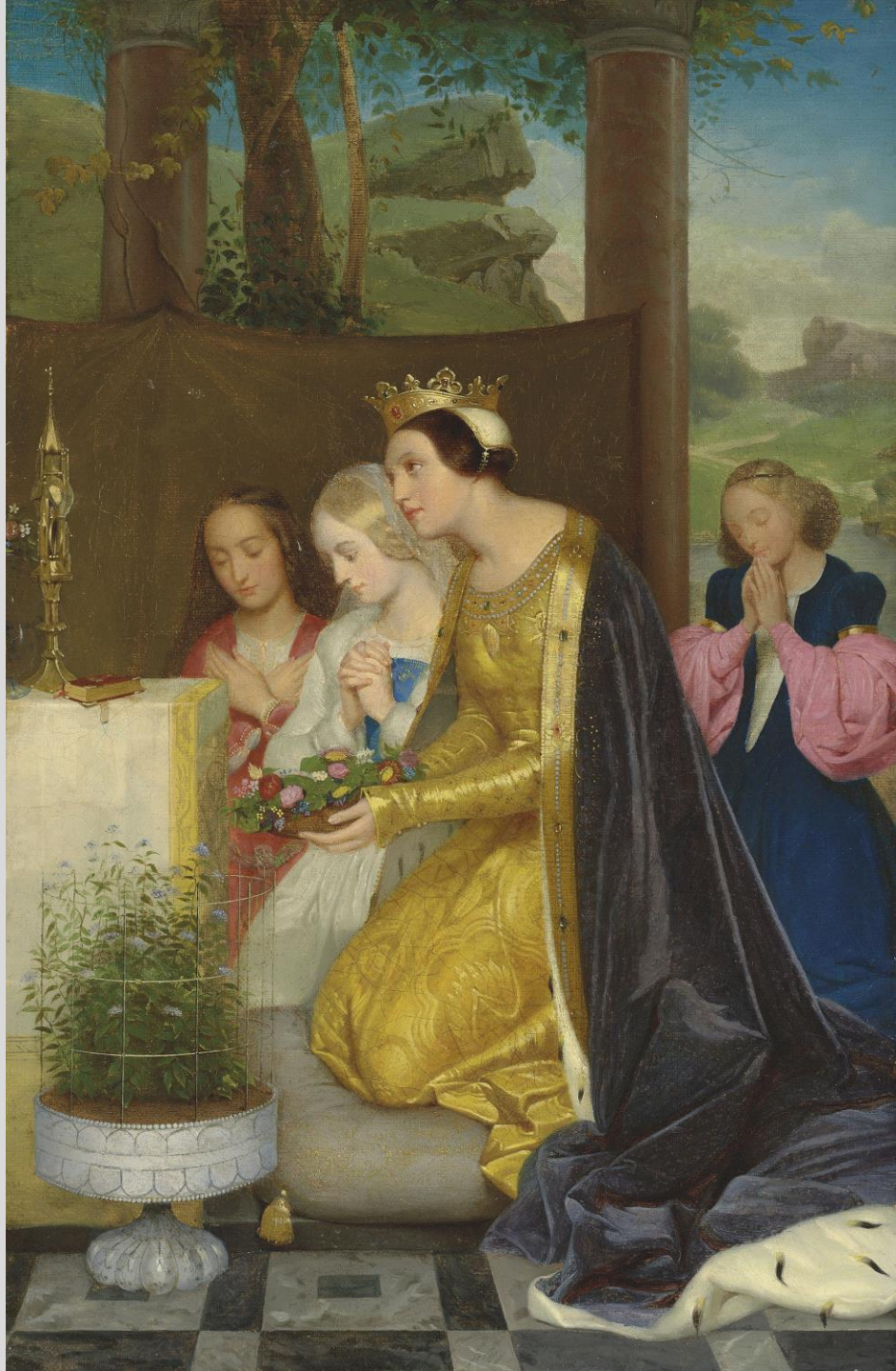
Paul Delaroche, Saint Amelie, Queen of Hungary, 1831