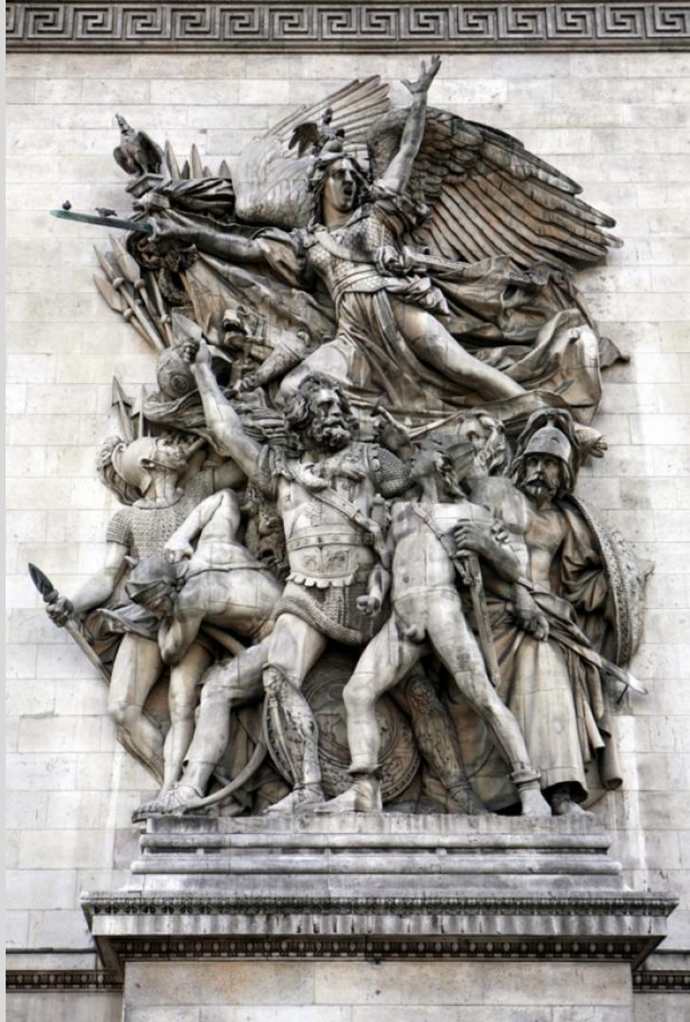
Rude, “La Marseillaise” – The Volunteers of 1792, 1833-6