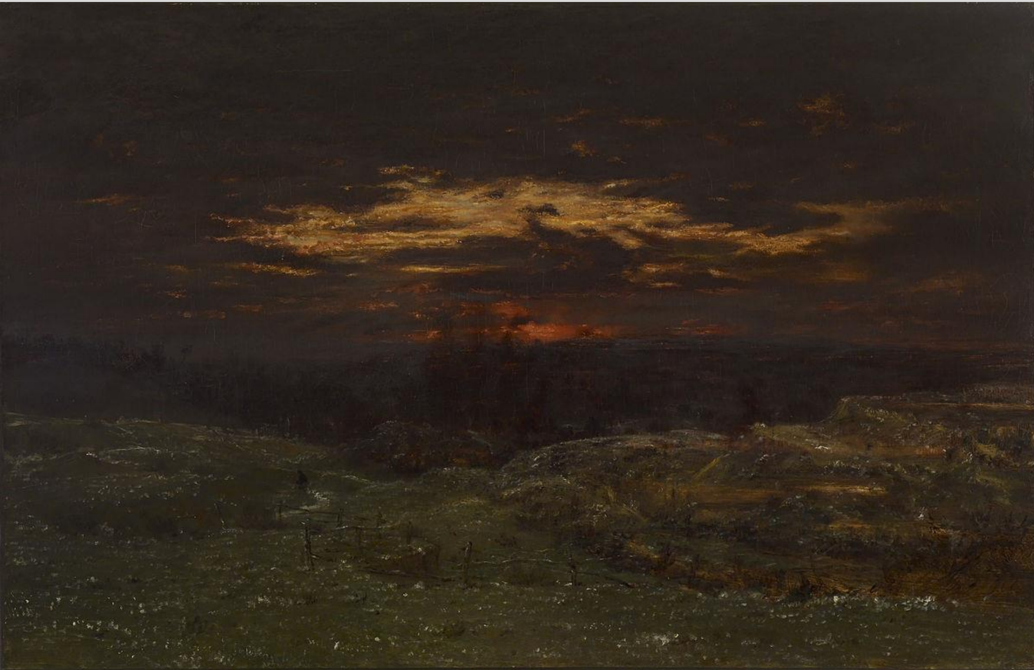
Rousseau, The Hoarfrost 1845