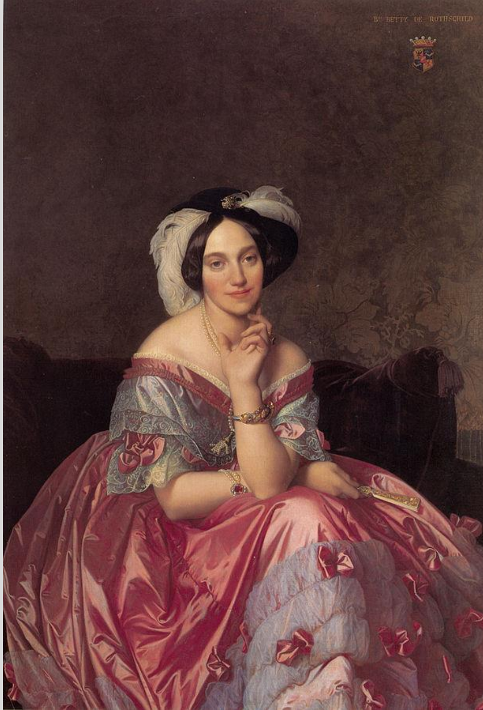
Ingres, Betty de Rothschild , 1848