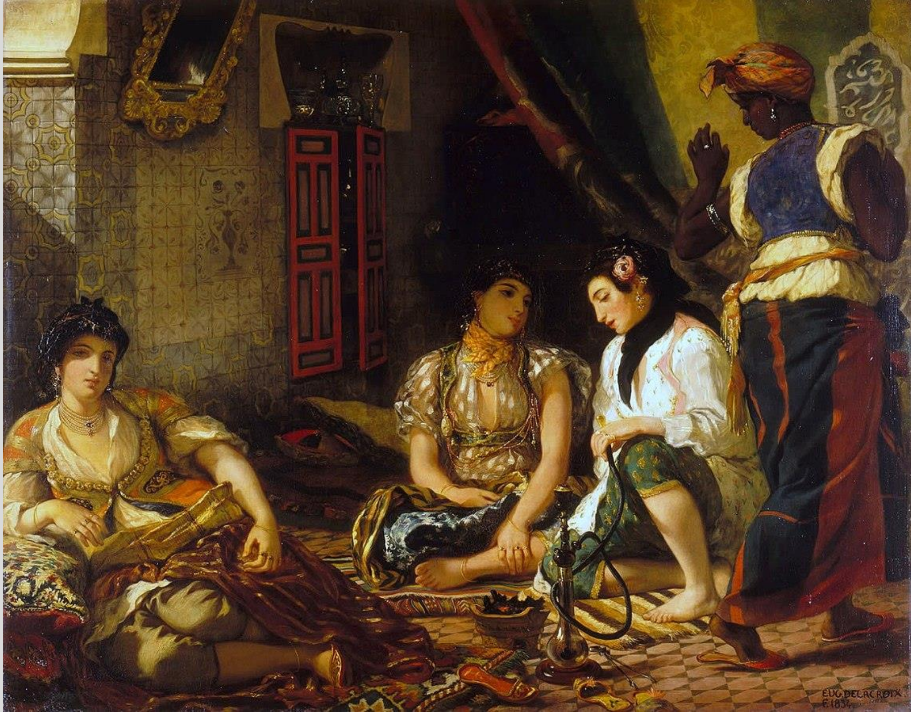
Delacroix The Women of Algiers, 1834