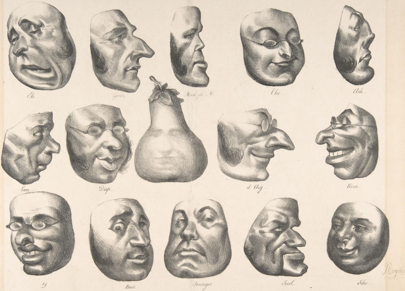
Daumier, The Masks of 1831, 1832, lithograph