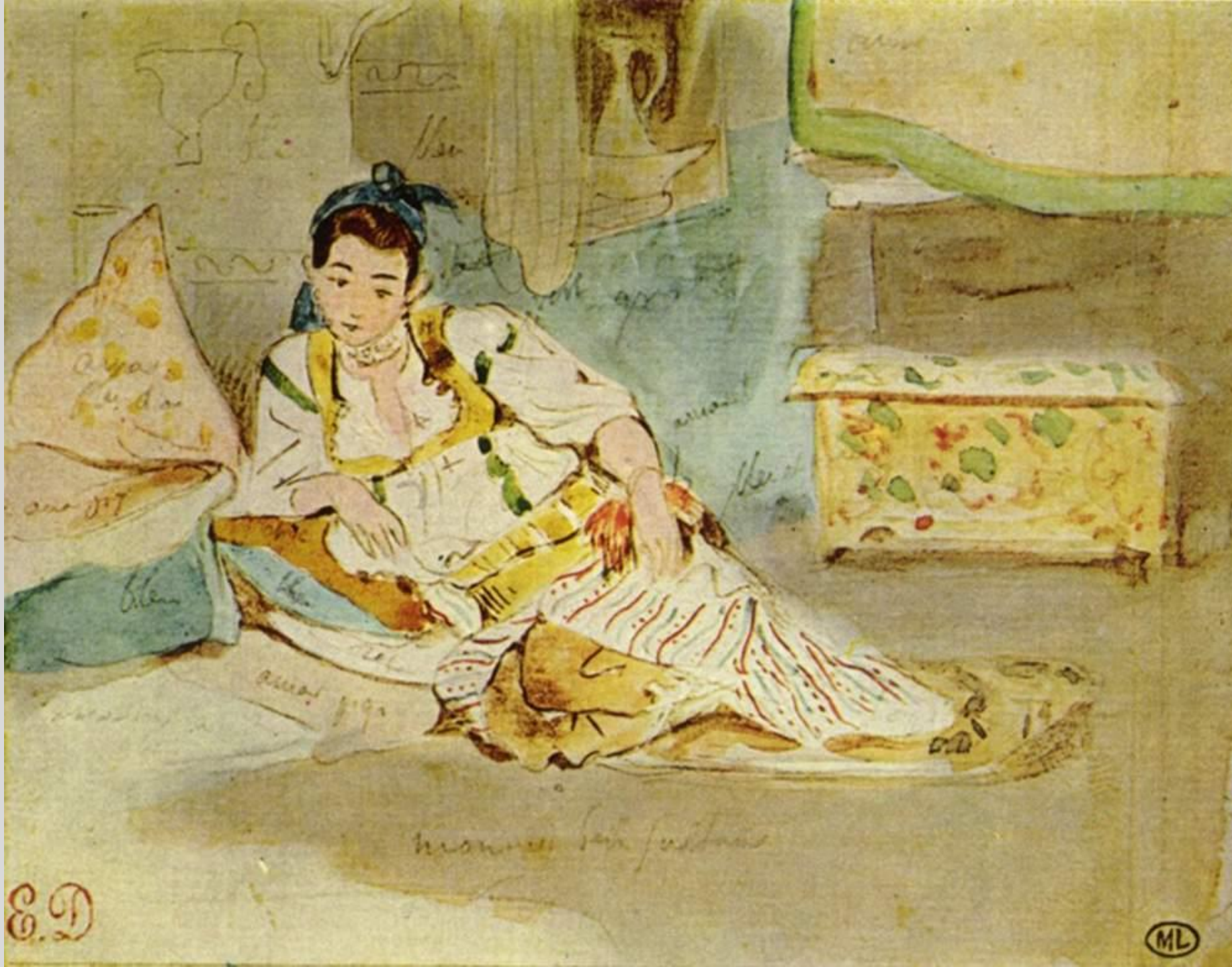
Delacroix, Studies for The Women of Algiers , 1832, Ink and watercolor